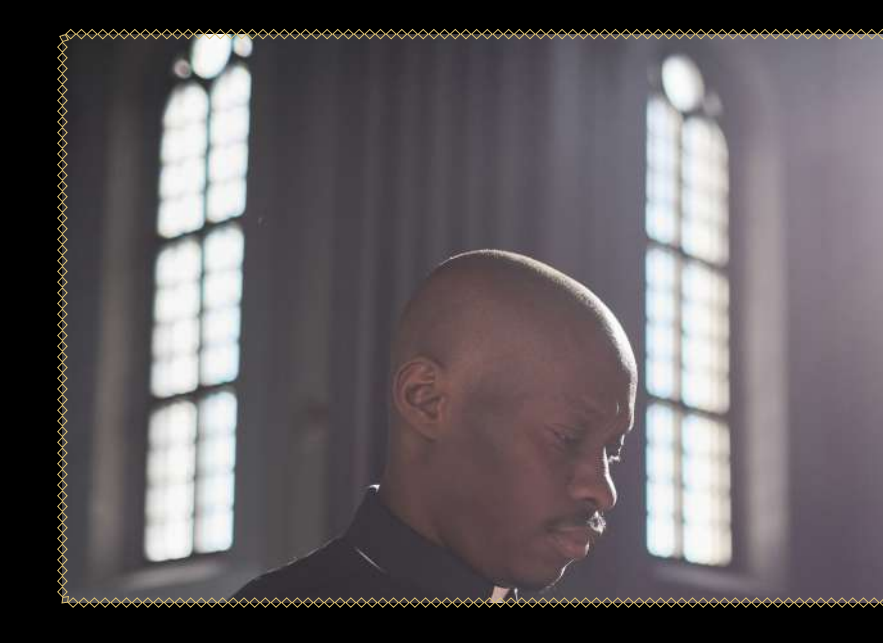
From birth, we are primed and trained to according to the dictates of