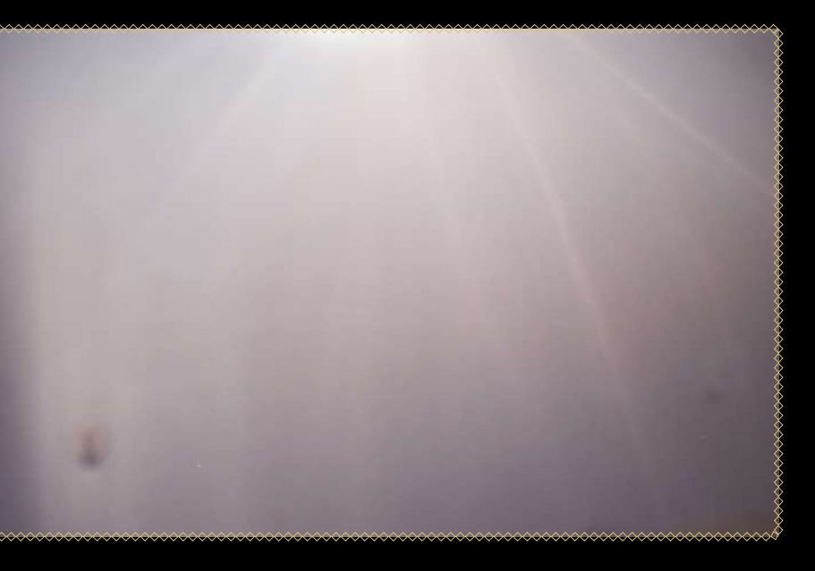
o think a certain way and believe and act men and women before us.

Committing to learning means you also invest in additional