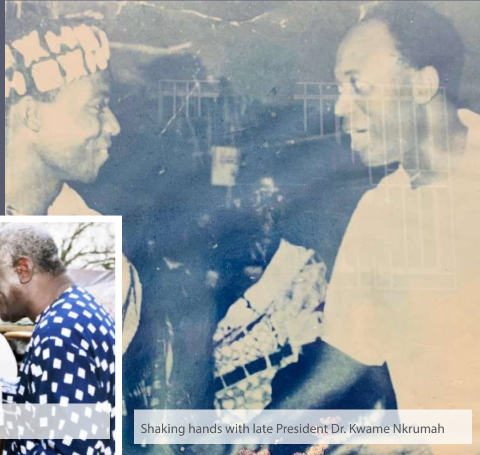
Shaking hands with late President Dr. Kwame Nkrumah

With Some Former Heads of State and Dignitaries of Ghana