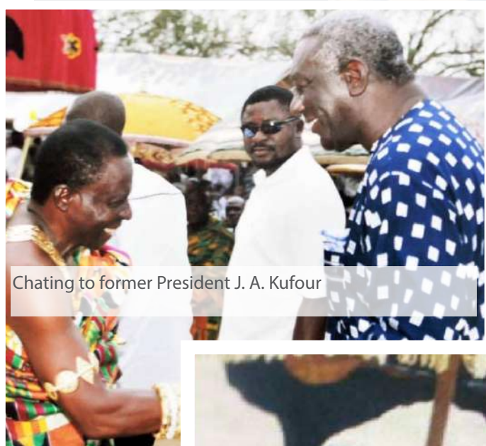
Chatting to former President J. A. Kufour