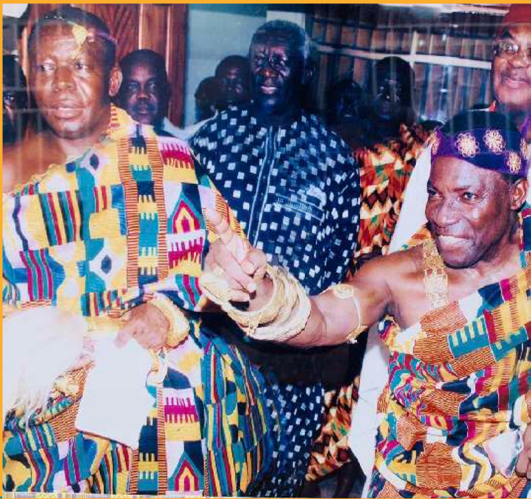
THE LATE ODEEFUO OWUSU AMOAYE II In Pictures