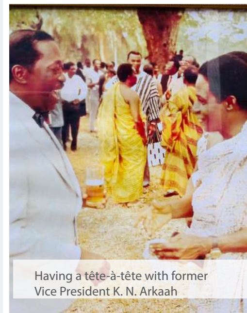
Having a tête-à-tête with former Vice President K. N. Arkaah