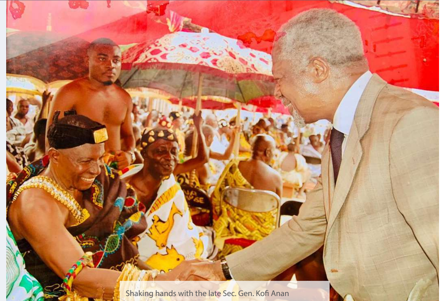
Shaking hands with the late Sec. Gen. Kofi Anan